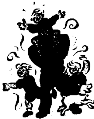
The enjoyment of a neighborhood!

Should a neighborhood help determine its future? If we have a uniqueness about our neighborhood, should we work to protect that? All of us who live in neighborhoods we chose and have grown to love would surely answer "yes"; but how to do that is not always so apparent.